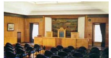
Weir Lecture Hall

The Weir Lecture Hall will seat up to 80, and can be set out in conference, classroom or seminar style.