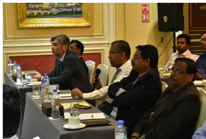
Members and Guests