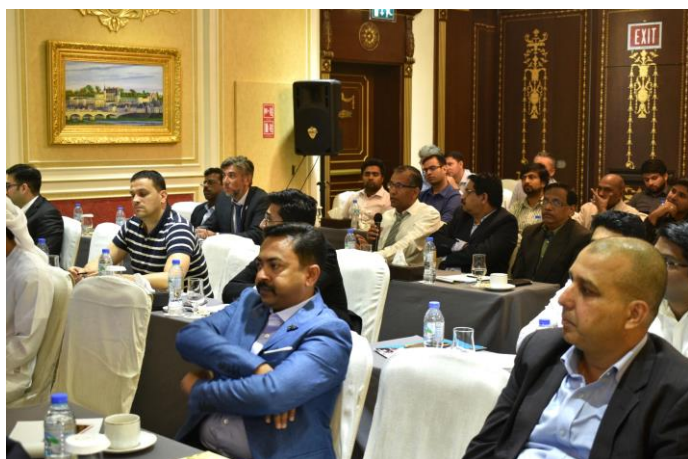
Members and Guests