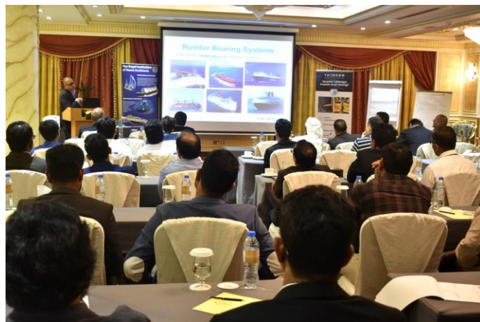
Members and Guests