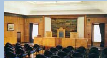
Weir Lecture Hall

The Weir Lecture Hall will seat up to 80, and can be set out in conference, classroom or seminar style.